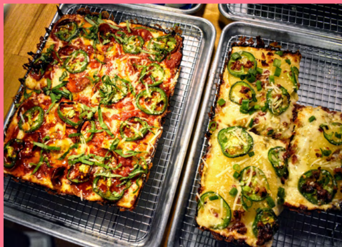
SoDough Square WP Bungalower and the Bus is the weekly podcast dedicated to Orlando's top headlines, new restaurants, and upcoming events. The show is co-hosted by Jon Busdeker and Bungalower's own, Brendan O'Connor. Tune in to Bungalower and the Bus every Friday on Real Radio 104.1 FM.